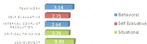
OVERALL RATINGS PER METRIC

At a glance you can see the questions were used in this interview set and which applicants rated strongest for each question asked.